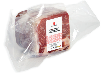
Foto del producto