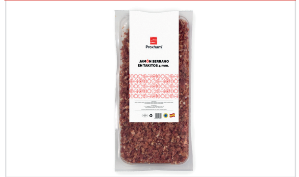
Foto del producto