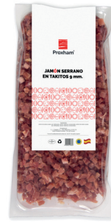
Foto del producto