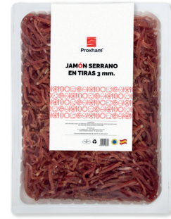
Foto del producto