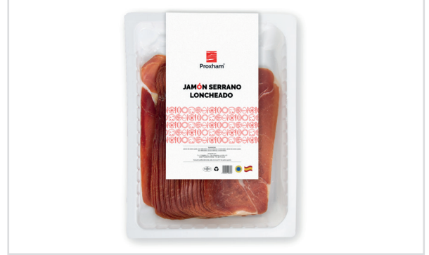
Foto del producto